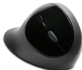
Pro Fit® Ergo Wireless Mouse—Black