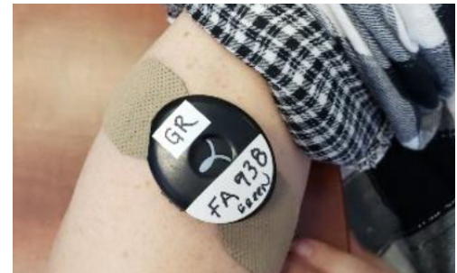
EMG sensors helped measure activation forces at each site.