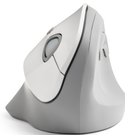
Pro Fit® Ergo Vertical Wireless Mouse—Gray