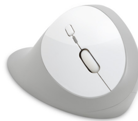
Pro Fit® Ergo Wireless Mouse—Gray