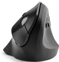
Pro Fit® Ergo Vertical Wireless Mouse—Black

The Kensington Pro Fit® Ergo Vertical Wireless Mouse delivers ergonomics at no cost to accuracy and precision. It is sloped at 46.7° to position the wrist neutrally and contoured to fit the hand comfortably. An extended lip on the right side gives the pinky a resting place, offering complete support to the entire hand for smoother muscle group movement. A fully-featured six-button design couples ergonomics with functionality — left, right, forward, back, and DPI (800/1000/1200/1600) buttons and a scroll wheel outfit the device. Its nano receiver provides wireless connectivity, and its low battery indicator ensures users will always have enough power to get through the workweek.